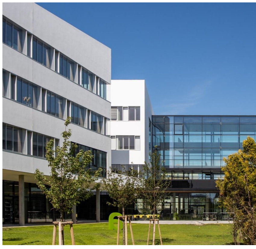
Danke für eure Aufmerksamkeit